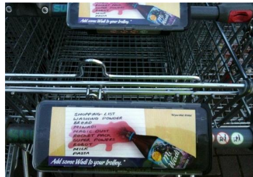
Call to Action: MiWadi on Trolley Handles

Public information campaigns such as the 'Drink Responsibly' initiative by MEAS and road safety messages from the RSA continue to feature strongly in the ambient arena.