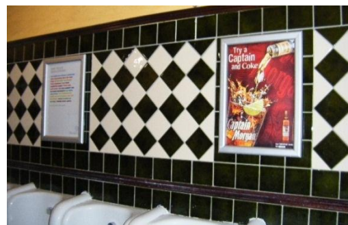
Social media: Captain Morgan on Washroom Panels

The Bar and Leisure Category is the second largest category, with 32% of the total spend. Socialising forms a big part of our daily lives. Ambient media owners have been quick to recognise this and as such there are a large number of media vehicles that interact with consumers as they enjoy their leisure time. Examples include certain in-bar media formats, cinema advertising, gym advertising and advertising at various musical and sporting events.