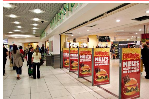
Brand Dominance: Kerry EasiSingles on Store Points