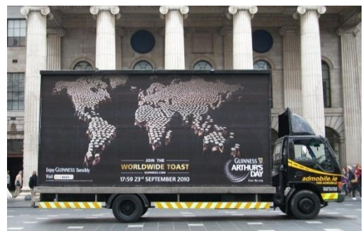
Moving Message: Guinness 'Arthur's Day' Admobile