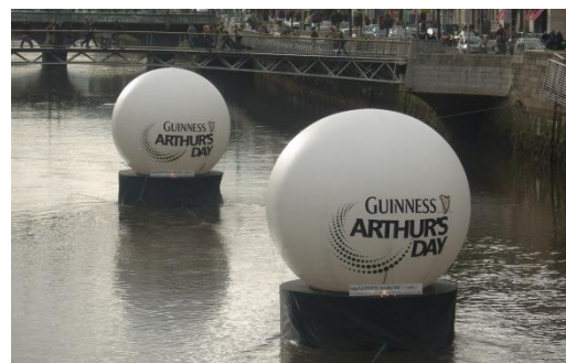
Illuminating: Guinness 'Arthur's Day' Liffey Spheres