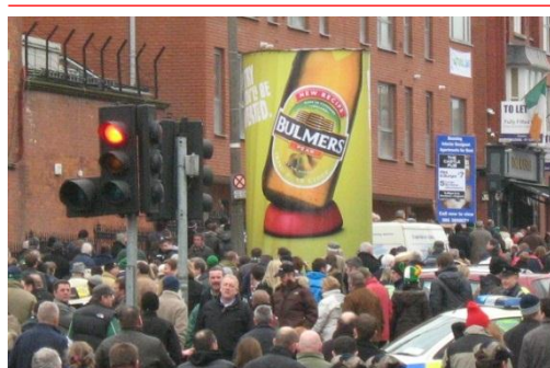
Standing out from the Crowd: Bulmers Adtower

In terms of spend, Beers and Ciders have emerged as the top sector. It is fair to say that this sector has had a tough year, however advertisers have responded to the challenges. Investment in ambient media has been key in sponsorship of sporting events, in particular rugby and GAA. This, coupled with events like Arthur's Day and various music event sponsorships, has taken the Beers & Ciders sector to the top of the spending table.