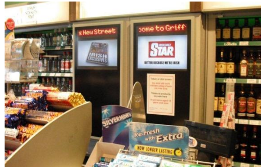
New Horizons: The Irish Daily Star on C Store Screens

Digital in Ireland is in its infancy but we believe that as a category it is going to grow in popularity and importance rapidly.