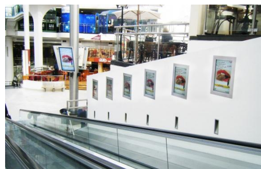
Captivating: Cadbury Flake use Digital at The Square

The ambient sector is currently providing a fertile test ground for digital advertising, with many advertisers using and experimenting with digital formats. Admobiles, interactive shop fronts and various video projections, together with newly emerging digital networks such as Digital at the Square (CBS), Transvision at Train Stations (Bravo) and C Store Screen (Visualise) are already on offer to the Irish market with more to follow in 2011.