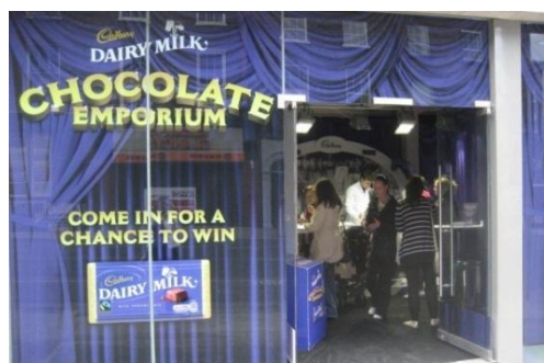
Engagement: Cadbury Dairy Milk POP Up Shop