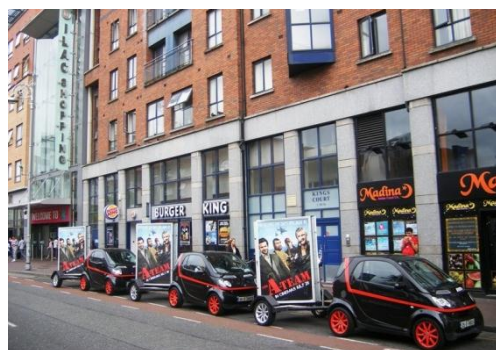
Targeted innovation: The A-Team Smart Cars

The Taste Buds were unleashed onto our street to mingle and “play” with the public, while Cadburys created their own mini walk in chocolate factories in each of the main cities where the public were invited in to see and taste the Dairy Milk product. This type of activity will grow in importance in 2011.