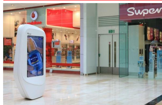
Digital Future: Dundrum Town Centre LCD Pods

Impressive case studies from abroad and a desire to move ooh into the digital age means that this category is very likely to grow exponentially in the coming years.